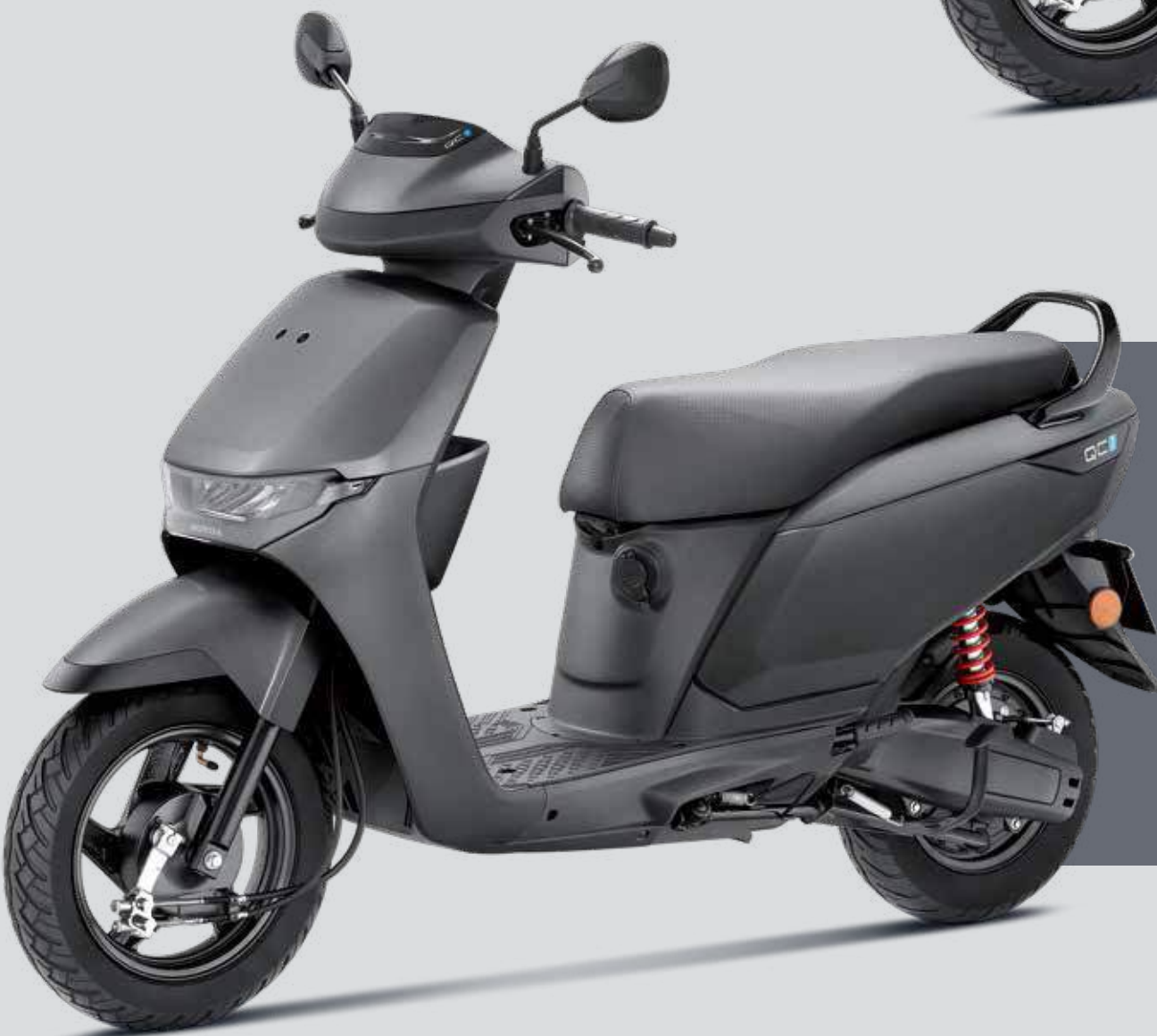
Matt Foggy Silver Metallic